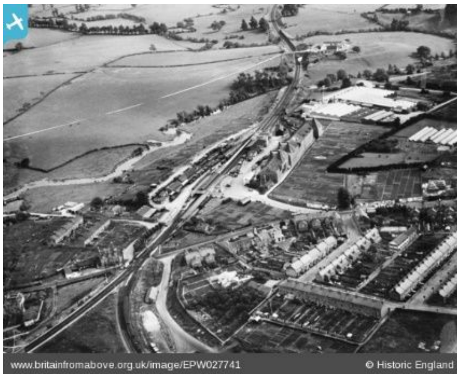
[EPW027741] The Railway Station and environs, Frome, 1929. A high resolution photograph is available in hard copy