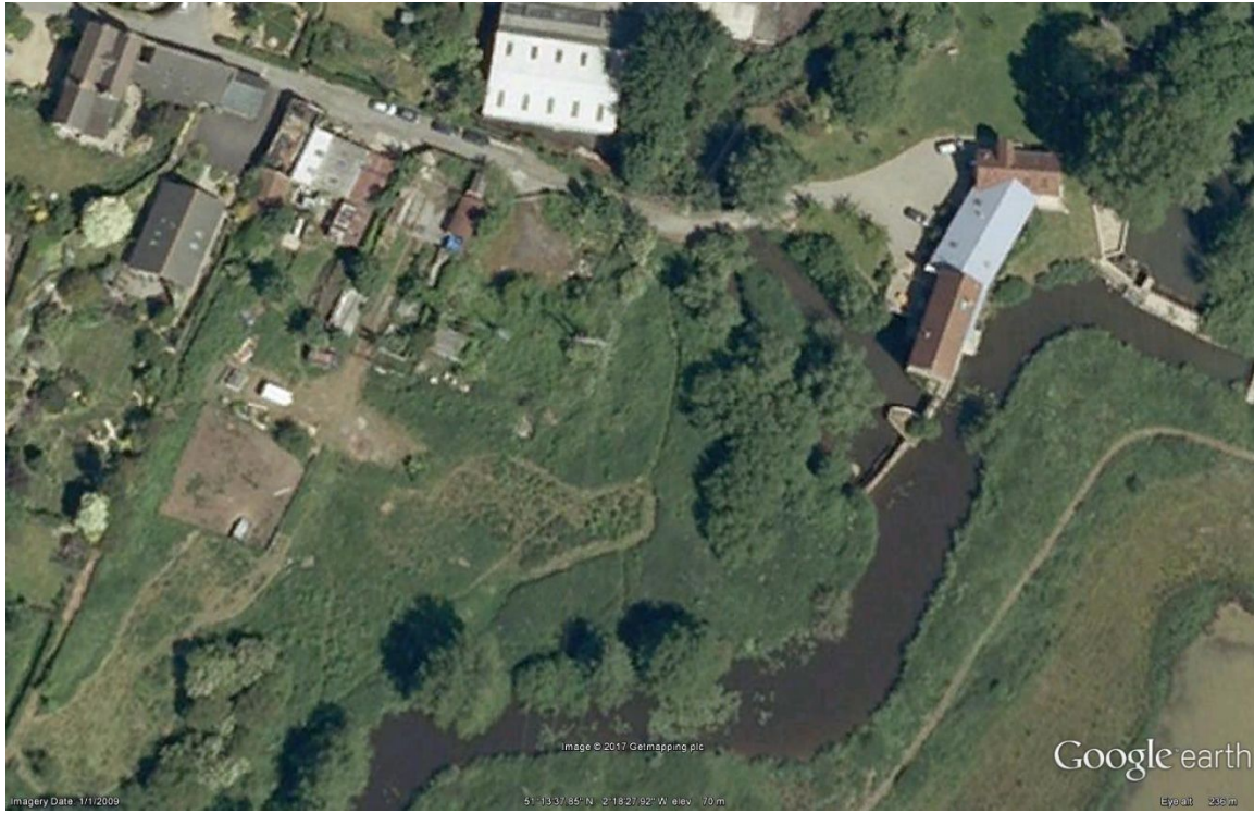
2014 (Google Earth)