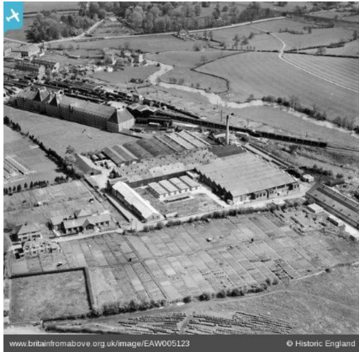
[EAW005123] The Butler and Tanner Ltd Printing Works, Frome, 1947. A high resolution photograph is available in hard copy