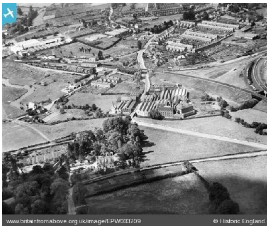
[EPW033209] The Wallbridge Woollen Mills and Portway, Frome, 1930. A high resolution photograph is available in hard copy